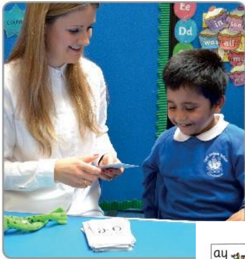
Learning the Speed Sounds in the classroom.